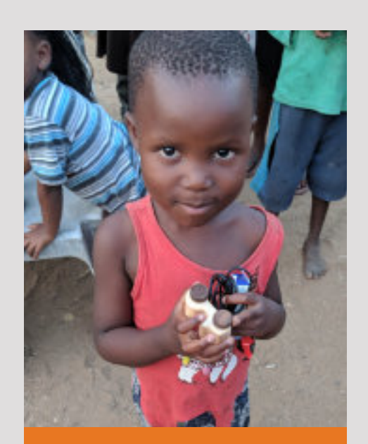
Let's change the future for children in need!

Your contributions are tax deductible. For more information: email: kris@savingorphans.com | phone: (317) 779-0001 mail: SOHO, P.O. Box 78156, Indianapolis, IN 46278