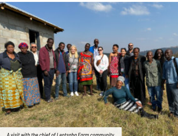
A visit with the chief of Lentsaba Farm community