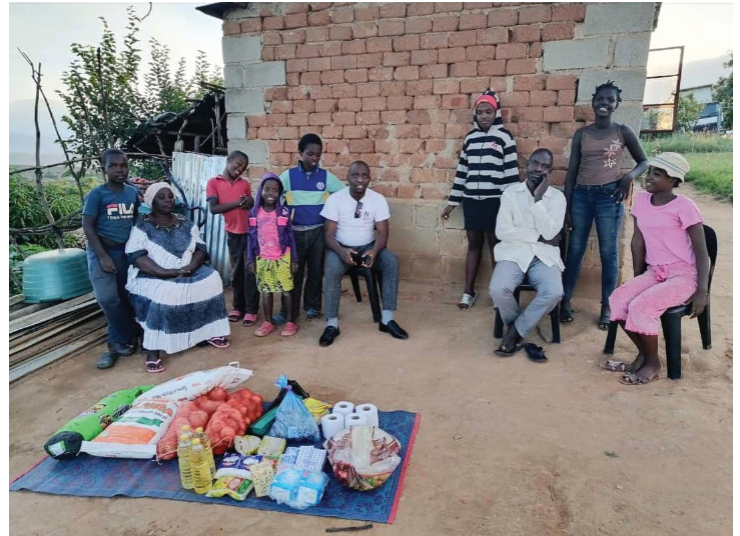
Food distribution helps those in need.

HOPE has changed her appearance, her attitude, and her vision for the future. SOHO thanks sponsors and donors who give so that children without hope can have a place at the table of opportunity.